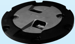
RCL / TDZ 8" 8" with 12" Ring

Compliances: FAA AC 150/5345-46: L-850A; L-850B ICAO Annex 14: Fig. A2-5 and A2-7 USN NAVAIR 51-50AAA-2 Transport Canada Specification K 271: Fig B5 and B8 UFC 3-535-01